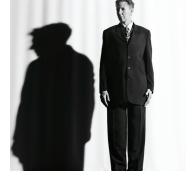
Figure 17