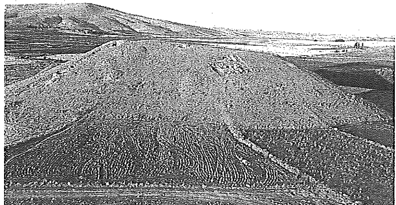
Çadır Höyük mound

My first encounter with the importance of re-approaching our understanding of the rural and secular Byzantine world came out of my involvement with the ongoing excavations at the site of Çadır Höyük, a site now jointly run by the University of Chicago, University of New Hampshire, and SUNY