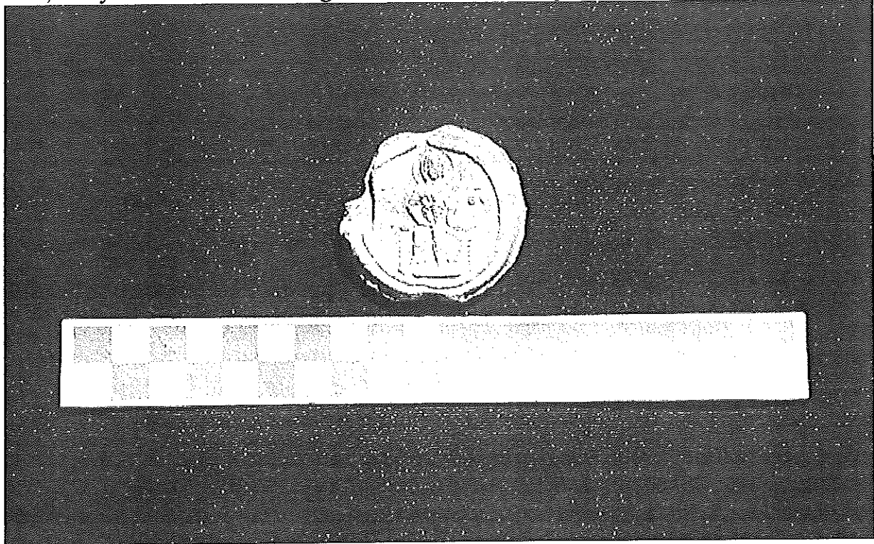
Samuel Alusianos seal

From the excavations themselves, we find further confirmation that the life of this site was representative of a small rural population defending itself in the face of a changing world. The mound provides a snapshot of the final days of the occupation of the site. On the mound itself, we found a lead seal belonging to Samuel Alusianos, a rather shadowy figure who served as a general around the time of the Battle of Manzikert. The seal indicates that whatever the population was, they received a message from Constantinople or the army in the area.