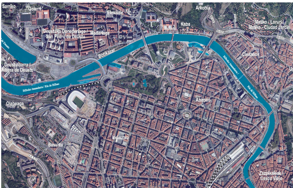
Figure 2. Bilbao. Ortophoto, aerial view of the river.

In the first stretch, which goes from the City Hall, the medieval city transitions to the modern urban expanse of the Ensanche (where the main calls for tenders from architects date back to 1862 and 1904) to reach the Guggenheim Museum, opened in 1997.