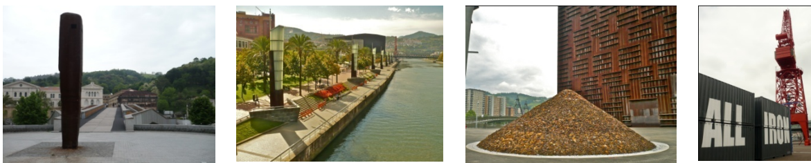
Figure 6. Begirari by Eduardo Chillida. Figure 7. The Memory Promenade with streetlights and palm trees. Figure 8. Façade of the Euskalduna Congress and Performing Arts Centre with artwork. Figure 9. The crane Carola at the Maritime Museum.

equipment, buildings, and structures that were built on what were once its most emblematic industrial production spaces. Where there were cargo ships there is now a congress centre whose façade replicates that of the old vessels. Where there were once cranes in the harbour, there are now streetlights that mimic the shapes of the tower cranes and hooks over the river, although these are now flanked by palm trees to underline the area's new leisure ambience. At the dikes where raw materials from the surrounding mines were piled in towering heaps, there are now sculptures that bring them to mind. It might seem that urban regeneration moves forward by physically eradicating the past and then evoking it through infrastructure that takes the place of what was erased. These items – dikes, cranes, etc. – formed part of a system of production relationships that have now been dismantled. Yet they are preserved as souvenirs sold over the counter in buildings whose functions and services are related to a very different economic model. Taken to the extreme, it is as if the city said to the past: “As long as you are here, I can't remember you.” The past made into a performance is always more profitable than the past which is merely rehabilitated. This can be called ‘evocative transformation’ and it pervades the urban philosophy of many European metropolises that have regenerated their public spaces.