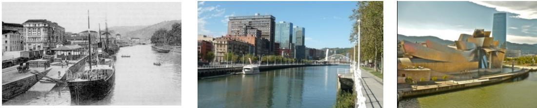
Figure 3. Historical views of the Uribitarte Quay. Figure 4. The Uribitarte Promenade at present. Figure 5. The Guggenheim Museum on Abandoibarra Avenue.

On this route, travellers witness how the old Ripa and Uribitarte quays, with their moorings and freight railways, have become broad promenades boasting leisure facilities. This first part of the route takes us from the seat of the city's political power to the more emblematic headquarters of the new Bilbao's 'tourism power' – a connection that has almost become a metaphor for the city (Plaza 1999, 2000). What takes us from one place to another is the memory of how this eminently industrial and commercial port city was dismantled and replaced by another where economic activities are now based on the service industries.