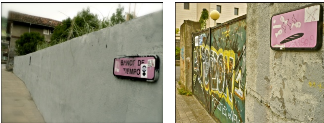
Figure 12. Zorrotzaurre: Time Bank 13. Figure 13. Zorrotzaurre: 'Fresh bread' pictogram.

This intervention ( Signal Art ) is not an evocative transformation like the ones we have analyzed in areas where urban regeneration is already proving to be profitable through a form of tourism that dismantles the past and fills it with tertiary services that evoke past industry and business in an attractive way. This case is more akin to transformative evocation because it evokes what is missing, a lack, a wish, a possibility (Sinclair 2003).