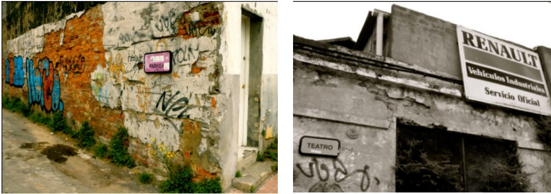
Figure 10. Zorrotzaurre: Park. Figure 11. Zorrotzaurre: Theatre.

This intervention made use of irony as well as political intent in the simplest possible manner (in our daily lives, we view signs as having an unquestionable correspondence between the space and its function). It also introduced the concept of open source code regeneration. This is regeneration that includes citizen participation and is receptive to the residents' initiatives. Open source code entails a double requirement: that not only the crucial role of the inhabitants should be taken into account when deciding what to put in spaces (counteracting a widespread complaint that residents are always treated like patients in referendums or the last customers in the queue), but that they should be recognized as players in the planning and change processes (Kotler 2004). Citizens are no longer content to wait until a higher administrative authority empowers them to act, and they find new grey areas between what is legal and unregulated to assert their positions in any debate on transforming their spaces (Lefebvre 2000).