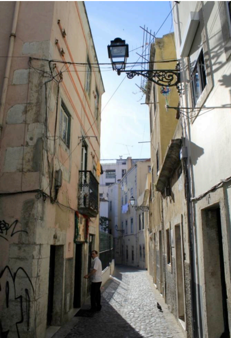
Figure 4. Rua do Capelão: Sub-neighbourhood 3 – The typical or the ‘real’ Mouraria for some (interviewee TR1).