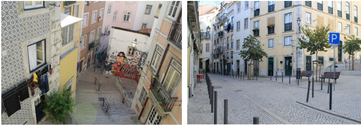
Figure 6. São Cristóvão: Sub-neighbourhood 5 – Described as the ‘new’ Mouraria (interviewee TR6).