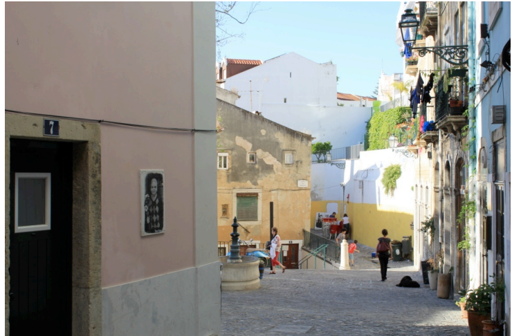
Figure 5. Largo dos Trigueiros: Sub-neighbourhood 4 – With a concentration of new gentrifiers and some traditional residents.