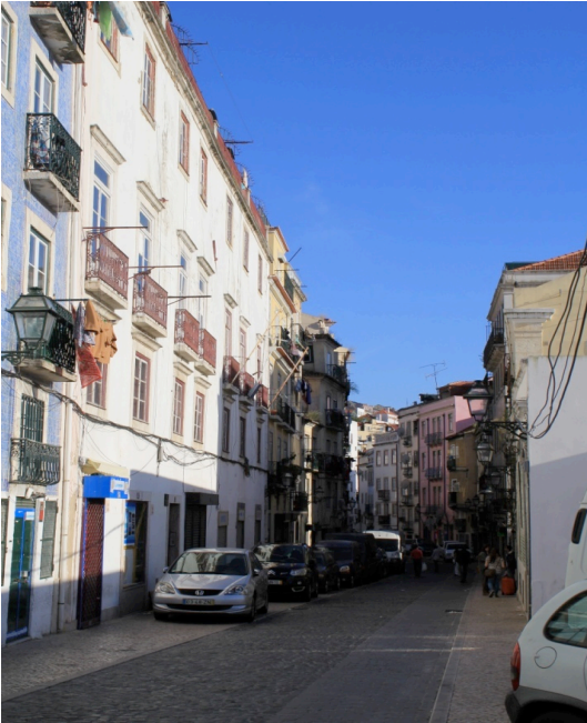
Figure 2. Rua do Benfornoso: Sub-neighbourhood 1 – High concentration of immigrants and their commerce.