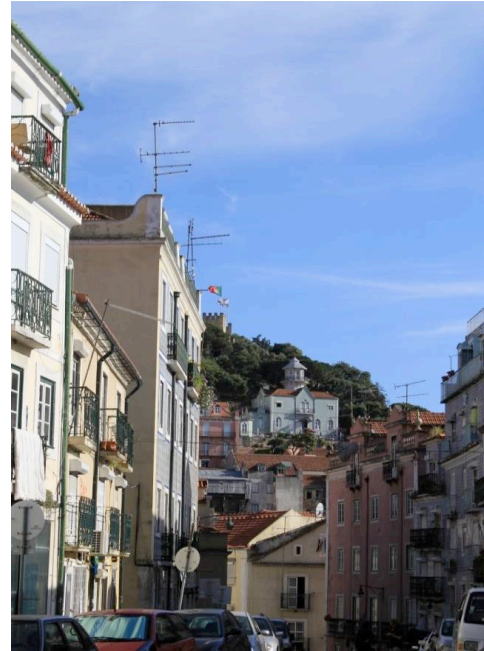
Figure 3. Largo das Olarias: Sub-neighbourhood 2 – High concentration of traditional residents.