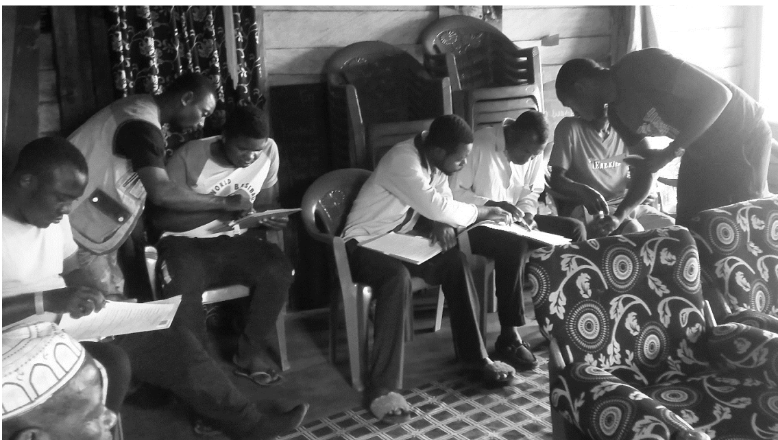
Figure 3: Conducting interviews at Munyange. The authors' field data gathered in 2017.

According to Doody et al. (2012), focus groups help researchers disclose knowledge uncovered by other methods of data collection. Consistent with this view, we reviewed unpublished data obtained from the MCNP office in Buea, targeting assessment and monitoring reports written between 2009 and 2016 by park officials, for the 41 villages around MCNP. Using this data, we were able to determine villages associated with the use of forests. To identify villages in contact with the park, we adopted Maxwell and Miller's (2008, p. 462) principle of