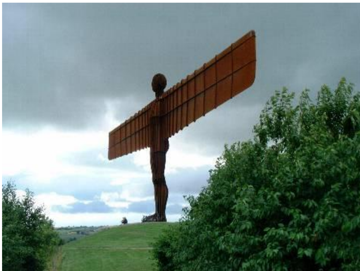
Figure 1 Antony Gormley’s Angel of the North – erected in 1998 and viewed by many as a sign of the regenerated north of England

In the three sections that follow we explore attempts to represent and rebrand northern cities with particular reference to Newcastle-Gateshead. The recently constructed urban image of the northern city and the cultural impression it creates exist alongside residual elements of urban landscapes, economies and cultures. Our enquiry looks in two directions – towards the real and towards the representation, and it attempts to chart the distance between the two. The first section outlines the background to the process: the transformation from industrial to postindustrial city; the political and economic changes associated with this; and the policy contexts that give rise to a policy driven concept of culture. The second section explores the form of urban rebranding and spectacle characterised by the image of party city with a reliance on advertising and consumption and certain forms of cultural participation. The third section involves a series of observations of two areas of Newcastle-Gateshead viewed through the filter of policy presentation, urban rebranding and spectacle. Our findings and conclusion point towards a considerable difference between existing reality in the area of culture and the social and economic fabric of northern cities and representations of the rebranded urban.