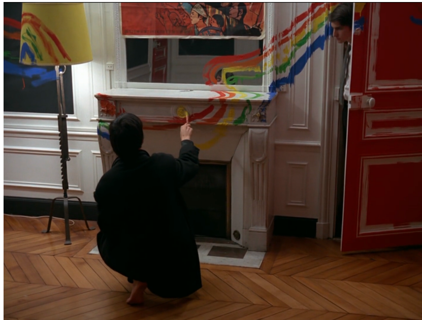
Figure 1: Screen grab from La Chinoise (1967).